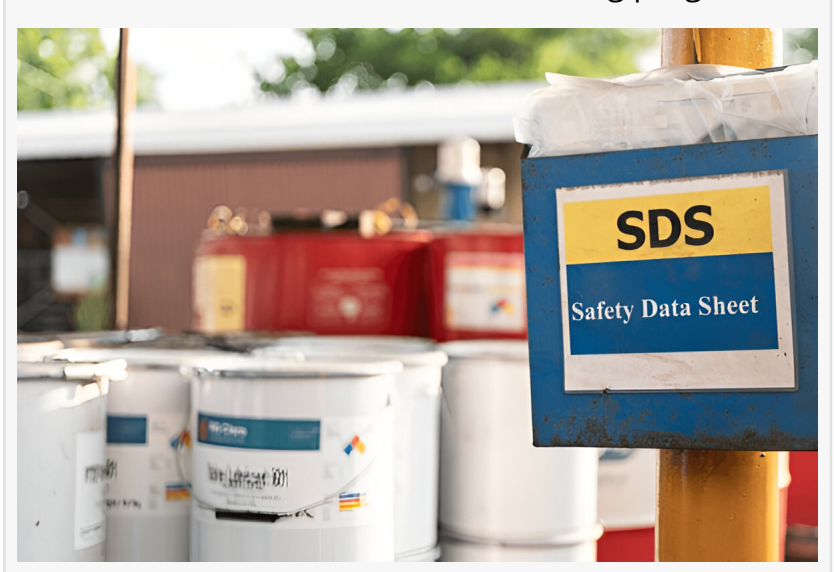
hazard communication safety training

Proper hazard communication is a critical component of workplace safety. Employees who handle chemicals must be able to recognize potential risks and take the necessary precautions to prevent exposure. Without adequate training, the risk of chemical-related injuries or illnesses increases significantly.