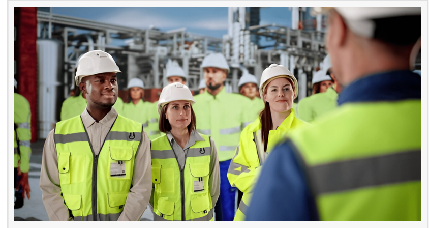
hazard communication standard training program

Enhancing Workplace Safety Through Hazard Communication