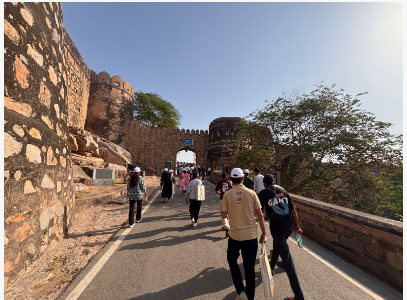
Visitors walk through Jhansi Fort, tracing stories of Rani Lakshmibai and the Bundela kings