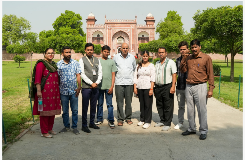
Agra Heritage Walk participants experiencing grandeur of Fatehpur Sikri, a UNESCO World Heritage Site.