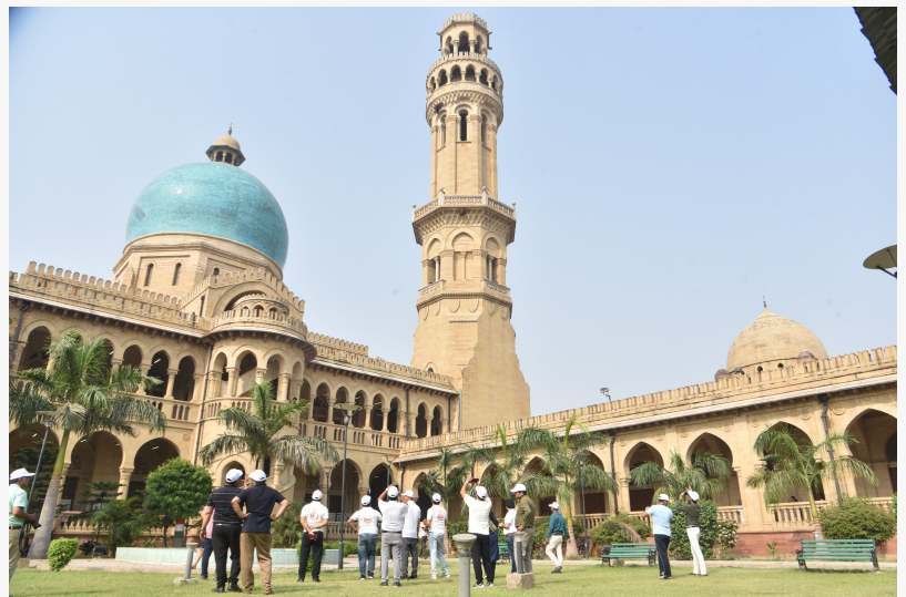
Visitors explore Allahabad University's grand turquoise dome and towering minaret on the Prayagraj Heritage Walk

To mark World Heritage Day, five heritage walks were conducted, offering a deep dive into the historical, cultural, and spiritual essence of each city. In Agra,