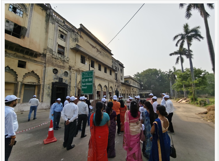
Lucknow Heritage Walk participants at the iconic Badi Chhatar Manzil

Several other landmarks reflect the region's historical richness, such as the Ashokan Pillars, the Buddhist Stupa at Pawa, and Mughal-era monuments like Agra Fort, Itimad-ud-Daulah's Tomb,