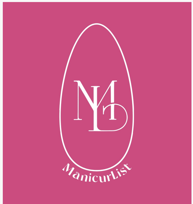
ManicurList: Your Personal Nail Art Organizer