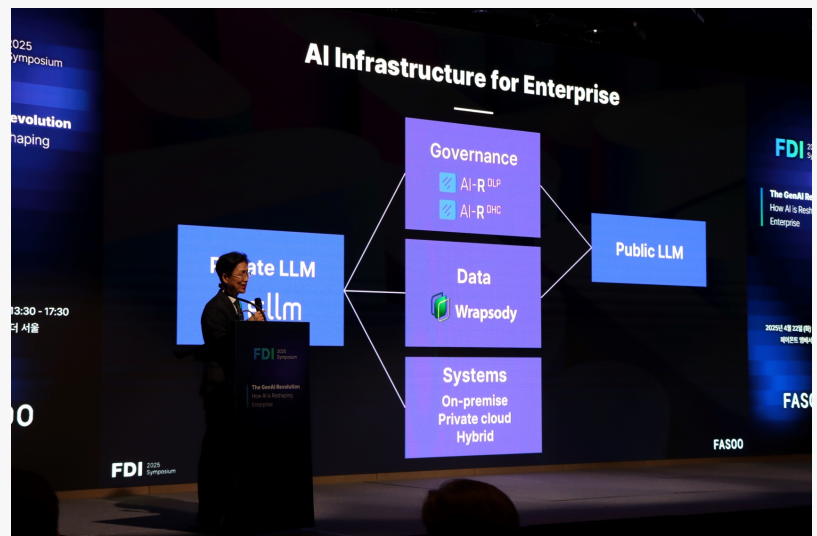
the Fasoo Digital Intelligence 2025 Symposium (FDI 2025)

Fasoo - a leader in data-centric security