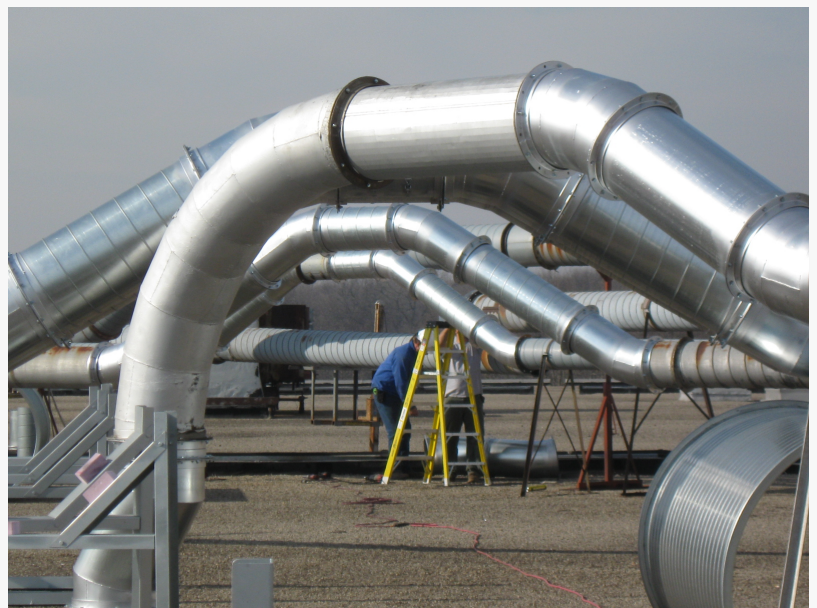
Heat Recovery Saves Energy and Money