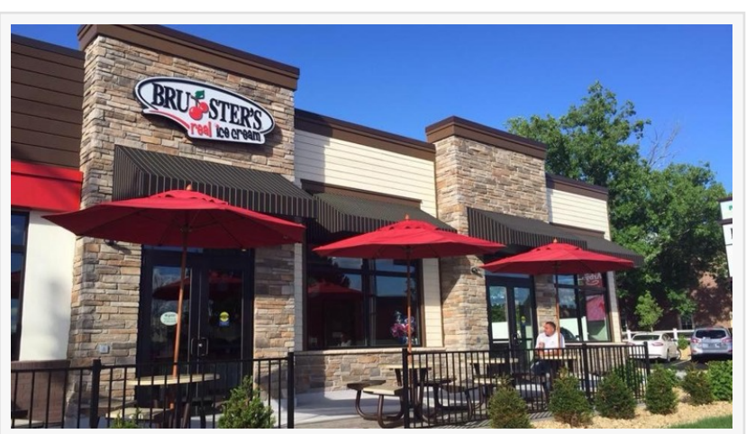
Unbroker Leads Sale of Bruster's Real Ice Cream of Nashua, NH

MILFORD, NH, UNITED STATES, April 23, 2025 /EINPresswire.com/ -- Unbroker, the fast-growing platform modernizing <u>small business sales</u>, today announced the successful transition of Bruster's Real Ice Cream of Nashua, NH to new ownership. The transaction marks another example of Unbroker's nationwide service, as more than 10,000 estimated Baby Boomers retire daily, fueling the largest transfer of privately held businesses in U.S. history.