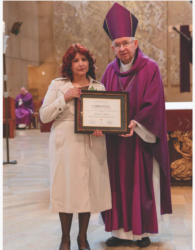
Christian Service Award

This press release can be viewed online at: https://www.einpresswire.com/article/805631202