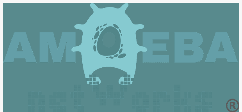
Amoeba Networks, Inc.

SeoSamba's expertise in thoughtful design, skilled coding, and state-of-the-art SEO strategies has created a platform that strengthens Amoeba Networks' brand presence and supports its mission