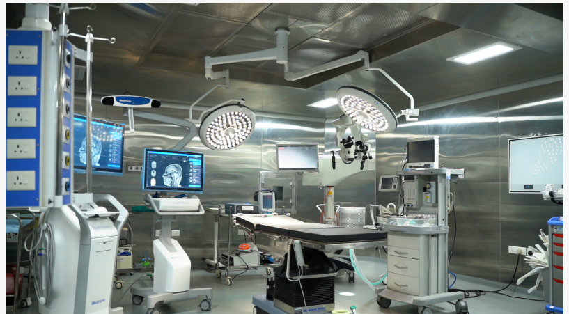
The high-tech neurosurgery operating room at Dr. Rao's Hospital, Guntur featuring advanced imaging and navigation systems for precise brain and spine surgeries.