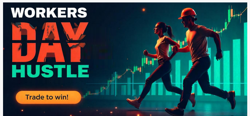
Workers Day Hustle