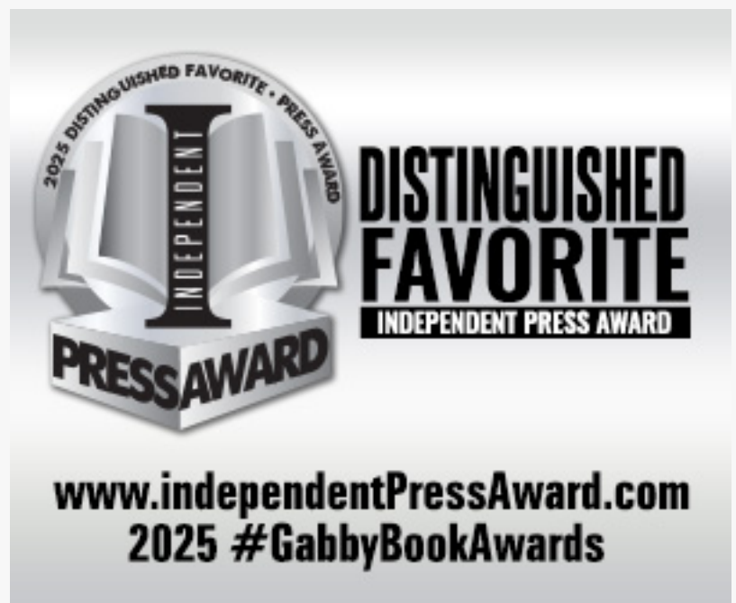
2025 Independent Press Award Distinguished Favorite