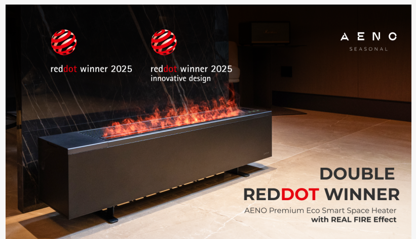
AENO Premium Eco Smart Space Heater with REAL FIRE Effect

/EINPresswire.com/ -- AENO's upcoming launch – the AENO Premium Eco Smart Space Heater with REAL FIRE Effect – has won two Red Dot Awards in the 2025 Product Design competition. The device was recognized in two categories: Heating and Air Conditioning Technology and Innovative Design. The Red Dot Award: Product Design is one of the world's most respected design competitions held since 1955.