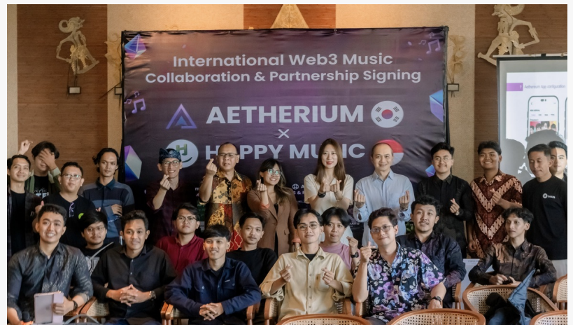
MOU Signing HappyMusic + Aetherium

HappyMusic, an Indonesian-based Web3 music streaming platform developed by PT Nusantara Creative House and brainchild of Anang Hermansyah, the well-known and popular Indonesia solo singer, musician, producer, politician and successful businessman.