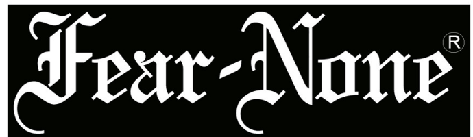
The now iconic FEAR-NONE Logo