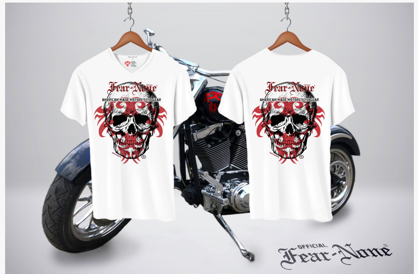
FEAR-NONE's 2024 Red Skull Rider shirt for Fall 2024