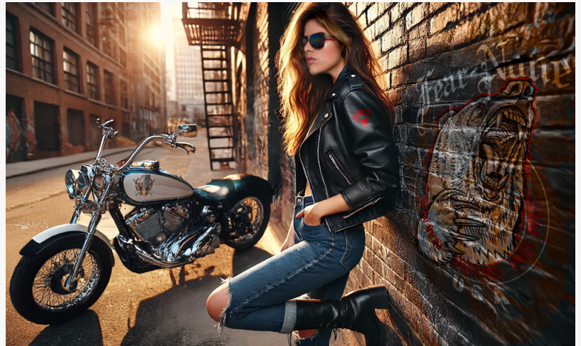
FEAR-NONE Original American Made Clothing

CHICAGO, IL, UNITED STATES, April 24, 2025 /EINPresswire.com/ -- FEAR-NONE Motorcycle Gear, the iconic American clothing and gear brand known for its no-compromise attitude and authentic American craftsmanship, roars into the new season with the launch of its 2025 Spring Collection — a fierce new lineup of original motorcycle clothing built for riders who live for the ride and demand gear that stands the test of time.