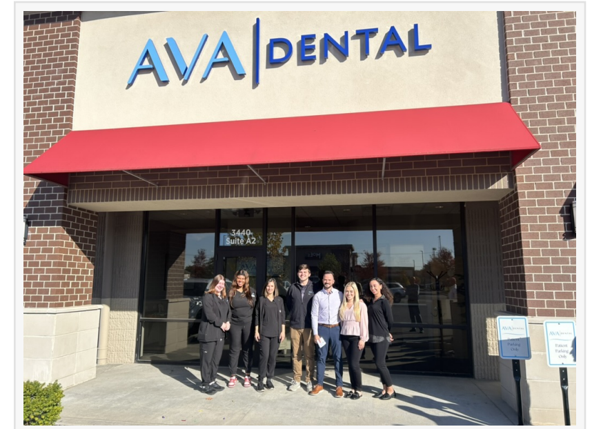
The team at Westfield dentist AVA Dental