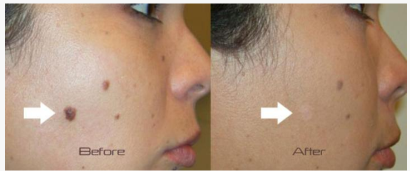
Skin Tag Removal Laser Treatment

These treatments, along with many others, are performed by a team of experienced professionals who take the time to understand each patient's unique skin concerns. They don't just treat the symptoms; they provide personalized plans designed to help each client feel comfortable and confident with their skin. Whether you're looking to tackle acne, reduce wrinkles, or simply refresh your skin, there's a treatment that can help you achieve your goals.