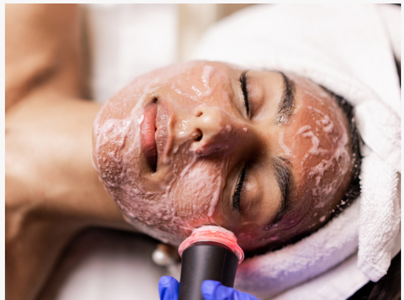
Oxygeneo Facial Before And After