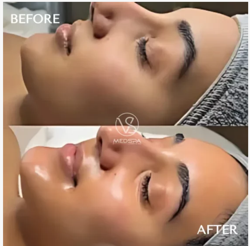
Skin Treatment Toronto