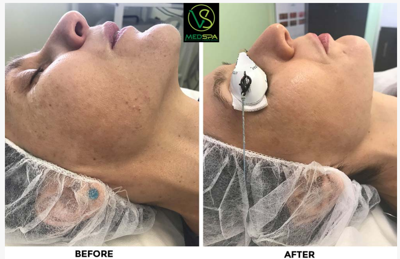
Ipl Photofacial Before And After