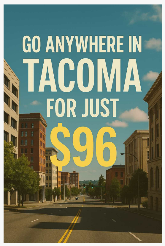
Go Anywhere in Tacoma for Just $96

often face emotional and logistical strain when coordinating transportation for aging parents. This initiative provides a practical solution, offering predictable costs and ensuring that rides are