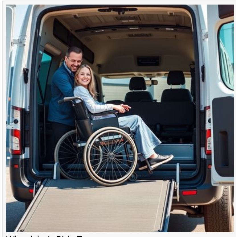
Wheelchair Ride Tacoma

In Tacoma, where more than 13% of residents are over the age of 65, accessible and affordable wheelchair