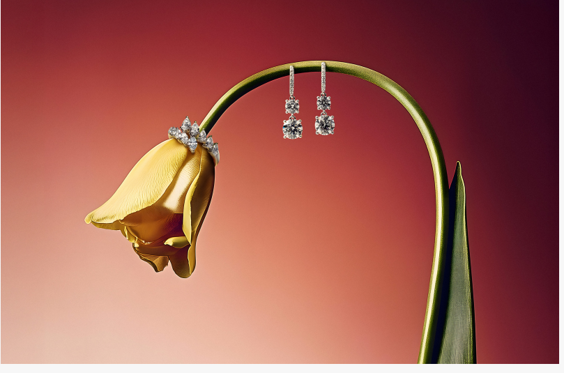
Flourishan Whispering Leaves Diamond Ring In 925 Silver;Flourishan Radiant Finale Diamond Earrings In 925 Silver

of just 24 lab-grown sapphire bracelets, with one piece available in each of eight captivating colors and three elegant cuts: heart, pear, and marquise.