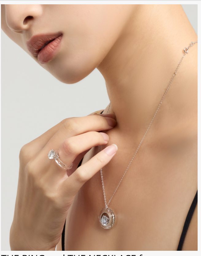
THE RING and THE NECKLACE from DESIGN LAB

This press release can be viewed online at: https://www.einpresswire.com/article/806573759