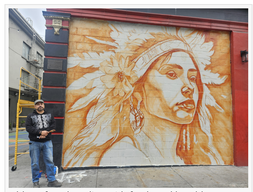
Ohlone female Indian with feathered headdress.

As the Tenderloin sees renewed investment and creative energy, Pomeroy's grand opening is emblematic of a broader community renaissance. Organizations like the