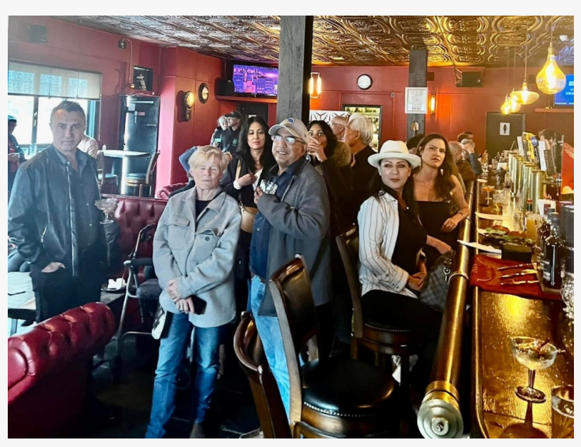
Happy People at Pomeroy

Tenderloin Community Benefit District (TLCBD) and the San Francisco Office of Economic and Workforce Development (OEWD) have played a major role in supporting small businesses,