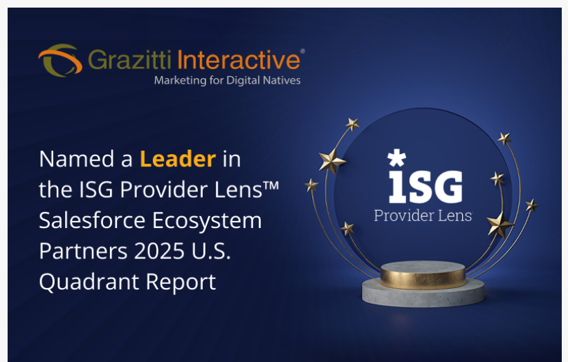
Grazitti Interactive named a Leader in the ISG Provider Lens™ Salesforce Ecosystem Partners 2025 U.S. Quadrant Report

Salesforce implementations and managed services. We remain committed to leveraging Salesforce's evolving capabilities to drive innovation and deliver unparalleled value to our