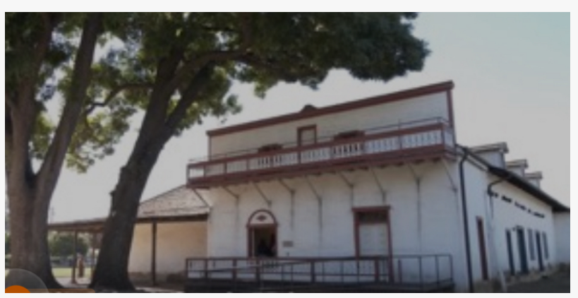
Pio Pico