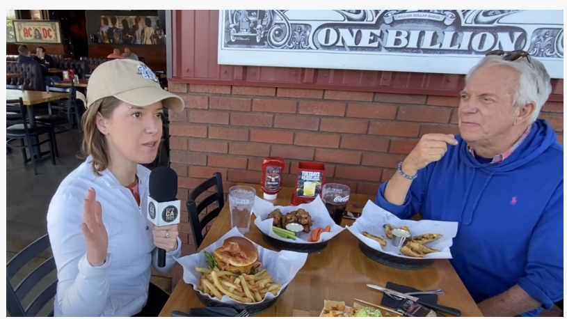
Rock & Brews, photo courtesy of Pat Pattison.