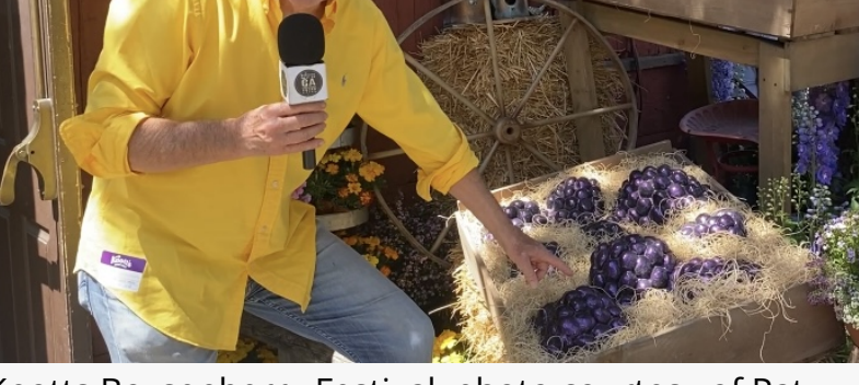
Knotts Boysenberry Festival, photo courtesy of Pat Pattison.

BestofCA segment: Things to do in Redding, CA