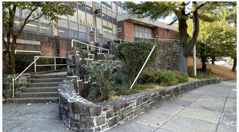
Joseph Greenberg School, Philadelphia, PA

The study employed a rigorous assessment framework and introduced an innovative performance metric known as the "Thumb Score," designed to clearly illustrate students' math mastery relative to their initial challenges. Joseph Greenberg students achieved a Thumb Score of 3.13, indicating they mastered more than three times the number of unmastered concepts, demonstrating substantial growth in mathematical proficiency.