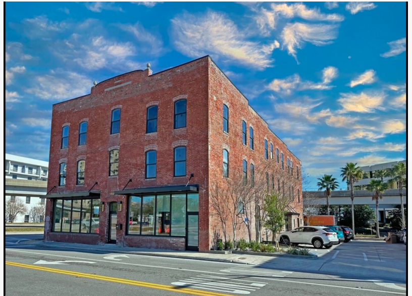
New Gailey Enterprises Real Estate Office in San Marco