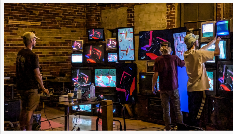
Studio Residency FEED

The third and a central component of OPEN FEED 2025 is the Two-week Onsite Residency. This program offers media artists a dedicated period to prototype and finalize artworks utilizing FEED's exceptional resources. Residents will have access to largescale studio and exhibition spaces within a historic century old building, as well as FEED's unique collection of digital and analog tools and technologies. The residency fosters interaction with the public, participation in community events, connections with other artists and cultural organizations, and provides pairing with a local artist for assistance.