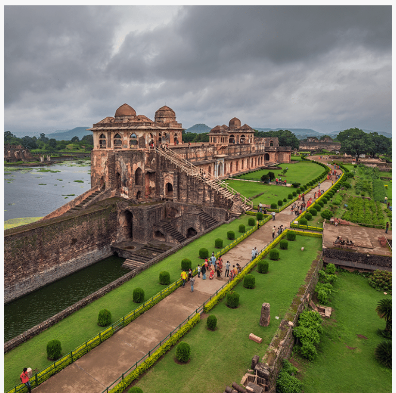
Jahaz Mahal: A Spectacular Architectural Gem Floating Amidst Mandu's Historic Splendor

Madhya Pradesh's participation at ATM will also facilitate impactful B2B networking with international travel agents, tour operators, airlines, and hospitality stakeholders—fostering inbound tourism and investment. Exclusive travel packages, limited-time promotional offers, and insights into upcoming infrastructure projects will further enrich the visitor experience at the pavilion.