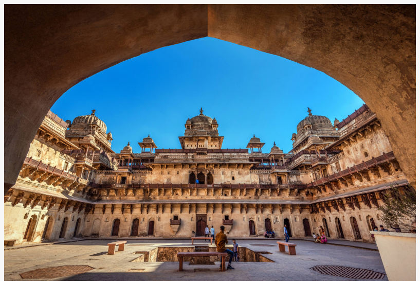
Jahangir Mahal - Orchha