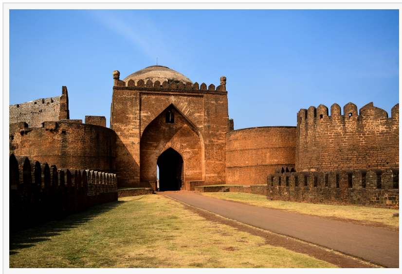
Bidar Fort: A majestic 15th-century fortress in Karnataka