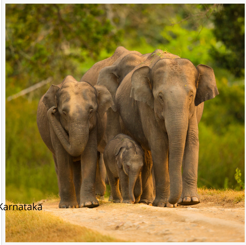
Elephant Family at Bandipur National Park in Karnataka

This press release can be viewed online at: https://www.einpresswire.com/article/806875279