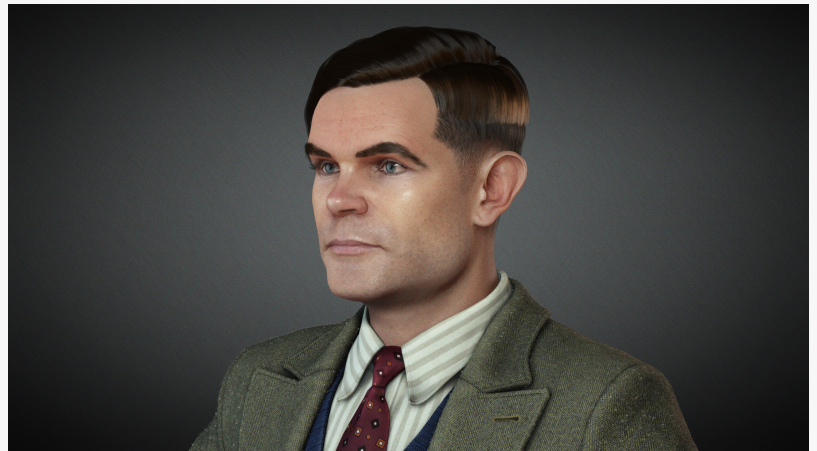
AI Alan Turing

AI Alan Turing isn't just a digital representation of the legend, it's a revolutionary approach to humanizing history through technology. Designed to resemble Turing in his early 40s, this AI offers thoughtful, verified responses to questions about Turing's life, work, and groundbreaking achievements in computing and codebreaking. Every detail, from his trademark sweater to the