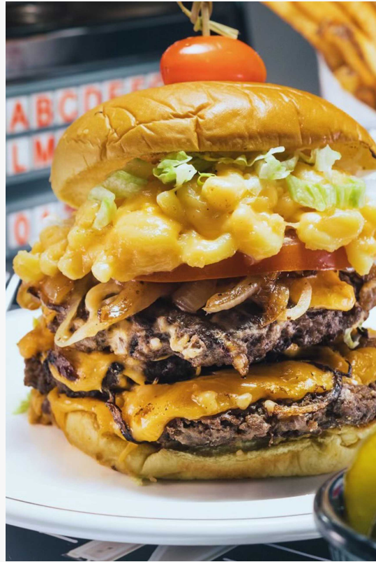
Diner 24 NYC's signature 12oz Smash Burger topped with cheddar, grilled onions, lettuce, tomato, and mac and cheese.

While the cultural identity of New York has long embraced the idea of activity at all hours, economic and social shifts have gradually reshaped that image. Businesses that operate overnight face distinct challenges, including staffing logistics and operational costs, but Diner 24