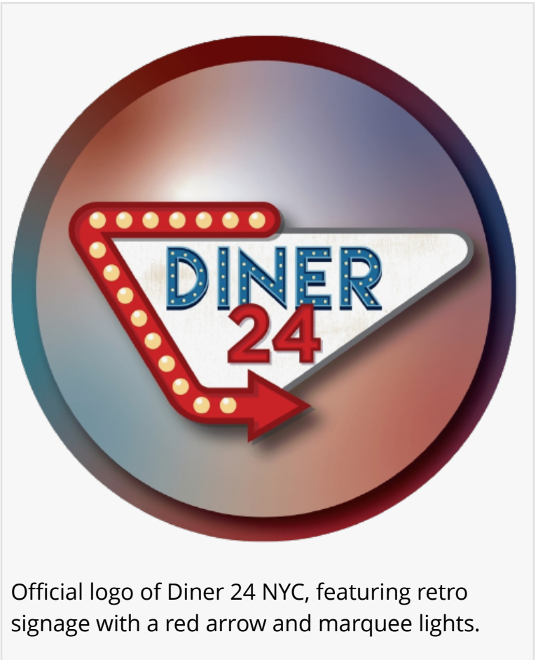
Official logo of Diner 24 NYC, featuring retro signage with a red arrow and marquee lights.

fewer spaces for spontaneous gatherings and late-night meals.