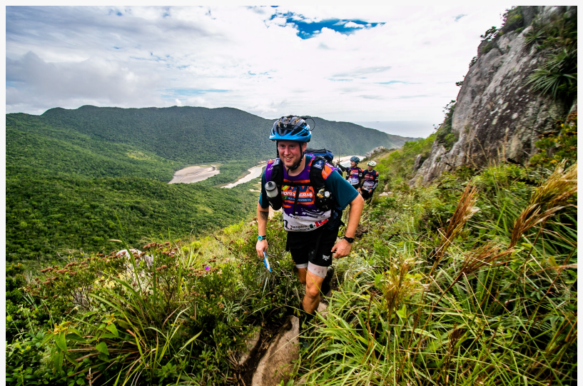
Competing in Brazil's Malacara Race

This year's location has undoubtedly been a big attraction with the race HQ in the UNESCO-listed