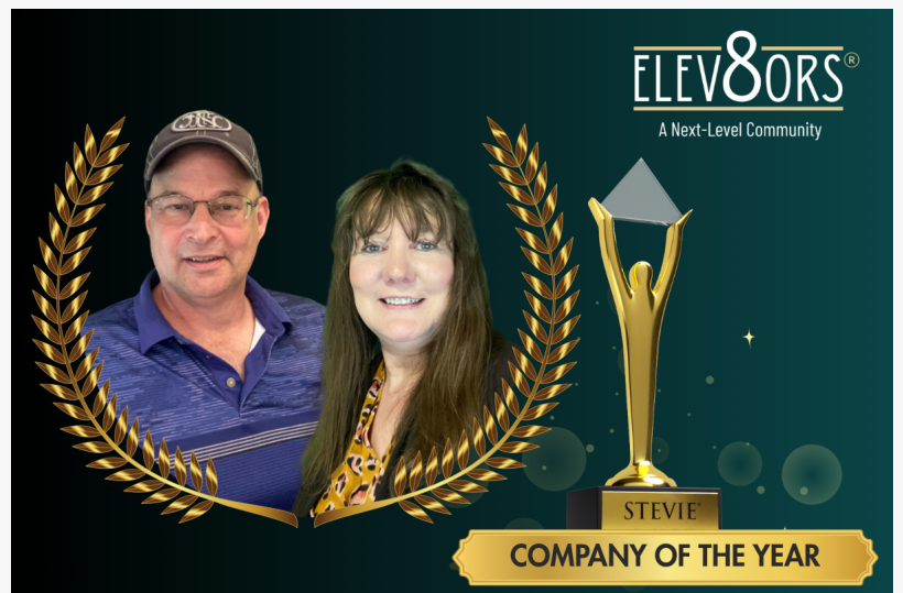
Elev8ors, B2B Networking Leaders, Wins the Company of the Year from Stevie Awards!