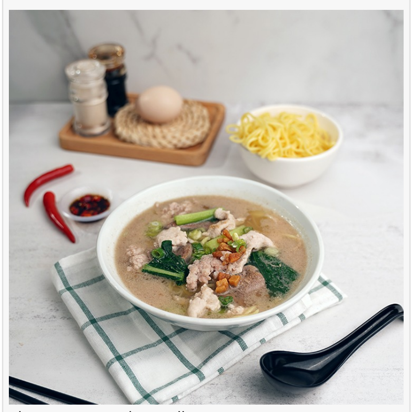
The Famous Pork Noodle