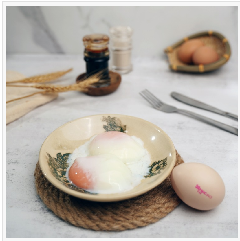
Best Selling Kampung EGG