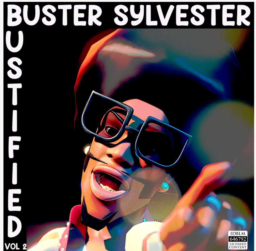
Bustified Vol 2 Cover Art