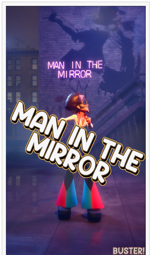
Man In The Mirror Video Cover