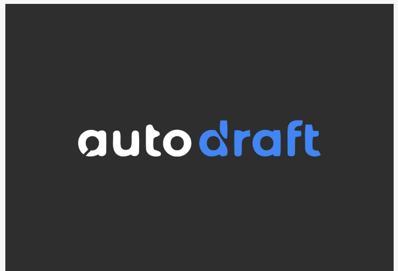
Autodraft Ai Logo