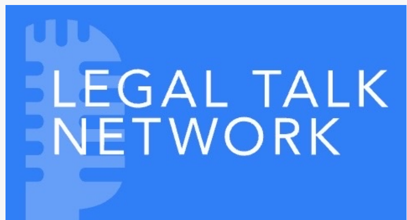
Legal Talk Network