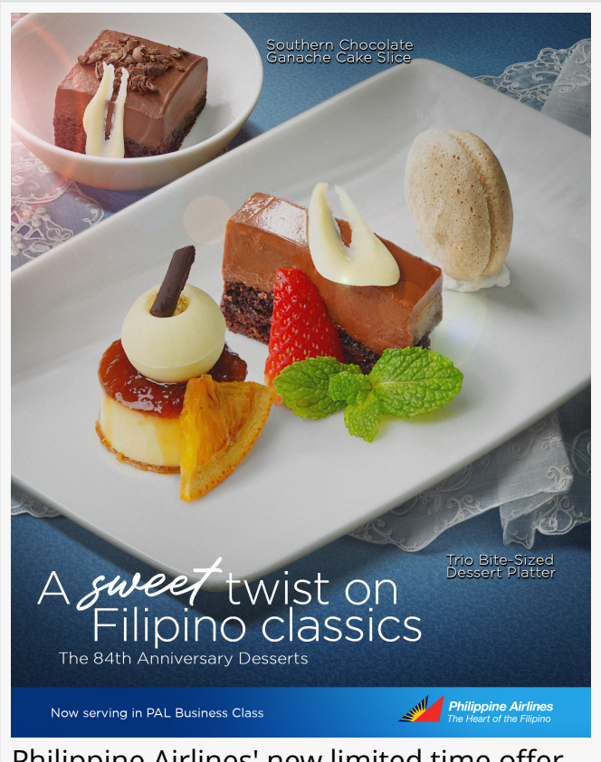
Philippine Airlines' new limited time offer for business class passengers include a special 84th anniversary desserts.

The special 84th anniversary desserts include the Trio Bite-Sized Dessert Plate consisting of the Classic Leche Flan Topped With Cantaloupe Syrup, Candied Orange, and Coconut Cream; Southern Chocolate Ganache Cake Slice; and Pacencia With Mango Butter Cream Filling.