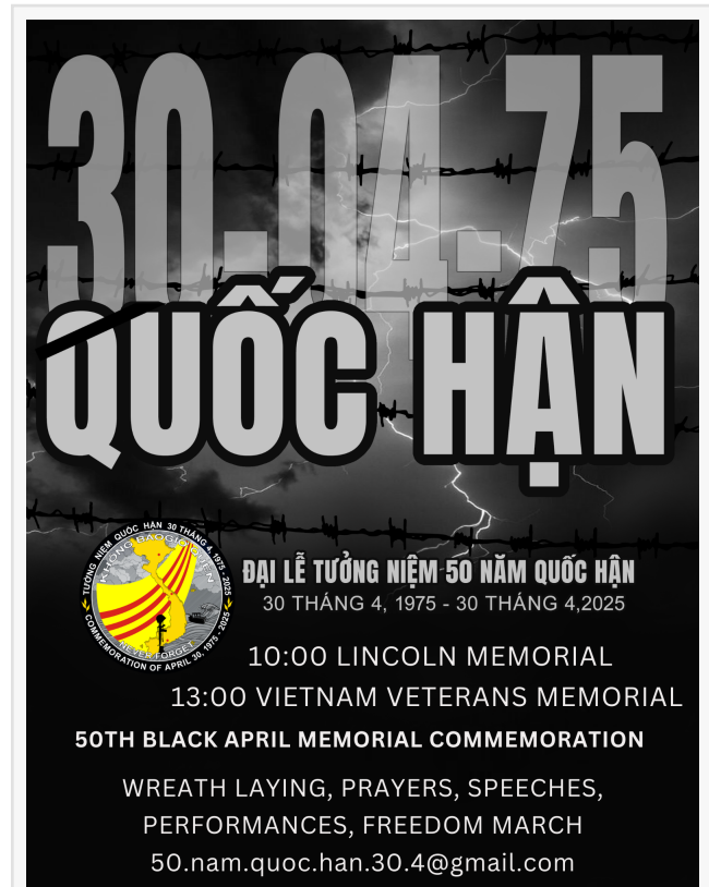
50th Black April Memorial Commemoration in Washington DC

Yet these remembrances are not solely for the Vietnamese fallen. They also honor the sacrifice of American servicemen and women who fought, bled, and died on the distant battlefields of Vietnam in defense of liberty. Over 58,000 Americans gave their lives in the Vietnam War, and countless others bore wounds—both seen and unseen—that they carried for the rest of their