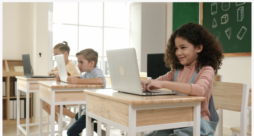
Having Fun Learning AI with DevLand