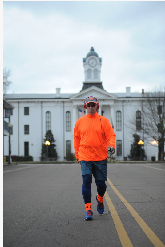
The Walking Man