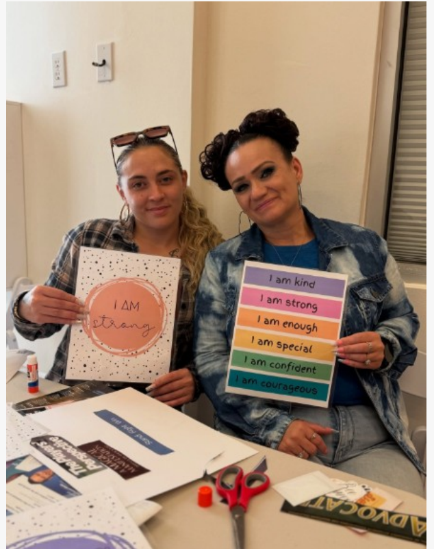
Women at the Fifth Annual Women's Empowerment Event hosted by LATLC & Clare