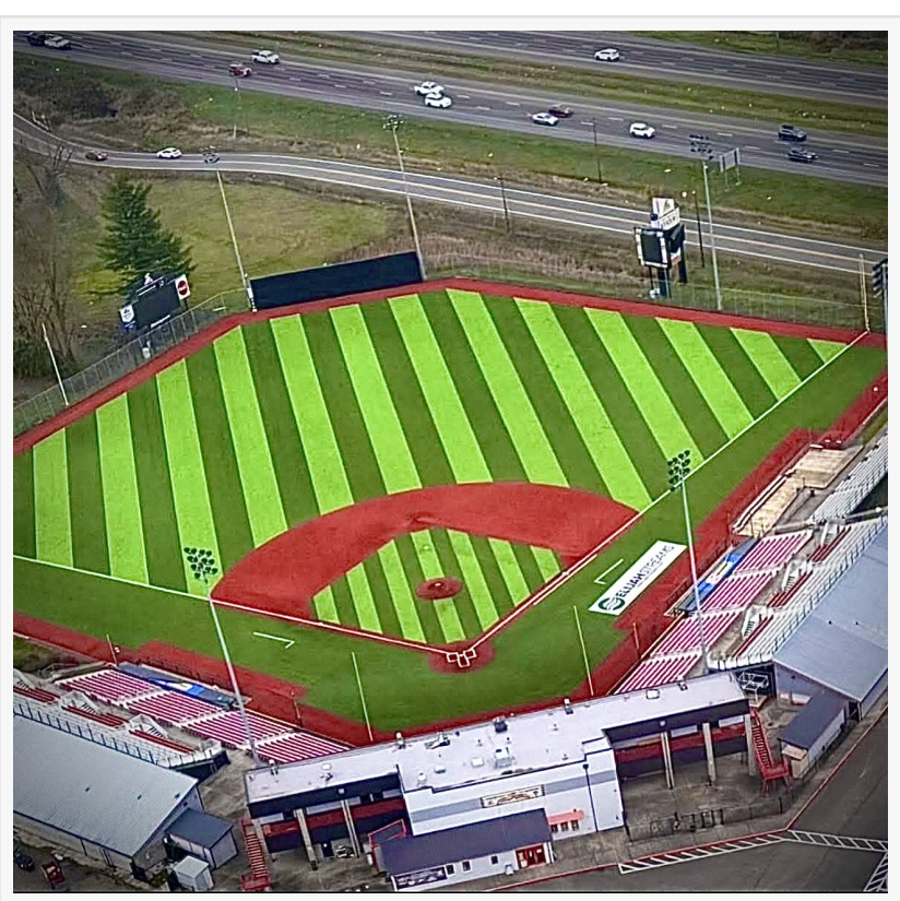
Volcanoes Field is now Roto-Rooter Park