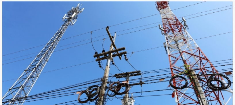
National Strand Supports the Broadband Market

Taking a proactive approach to achieving Buy America compliance makes National Strand a key player in the initiative’s effort as it continues to supply high-quality, American-made stranded wire that’s used in broadband expansion projects across the country.