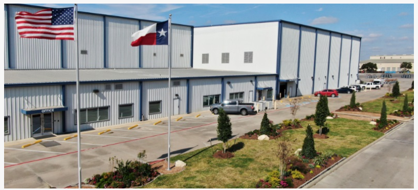
National Strand's new, state-of-the-art 55-acre facility in Baytown, TX

The video content, which will be available later this year on the company’s website and social media channels, is designed to set an industry example and further increase brand awareness in relevant markets. The goal is to help project leaders, policymakers, and contractors better understand what true Buy America compliance looks like and why domestic sourcing matters now more than ever.