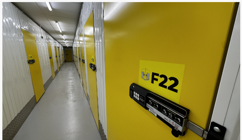
ExtraStore-Belfast manages remote facility with OpenTech INSOMNIAC SmartLocks®, CIA access control and a self-service kiosk

To enhance the tenant experience, ExtraStore will also leverage interactive property maps to allow customers to explore unit locations and amenities from the kiosk before renting. Reliable connectivity across the property is supported by INSOMNIAC OpenNet™, the wireless mesh network that comes included with every SmartLock system. This ensures robust internet access for onsite devices while creating infrastructure for future smart sensors to monitor and manage property conditions, such as HVAC systems, security cameras, and environmental and motion sensors.