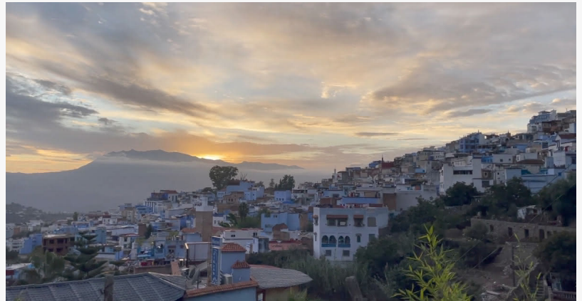
A stunning sunset view of Chefchaouen