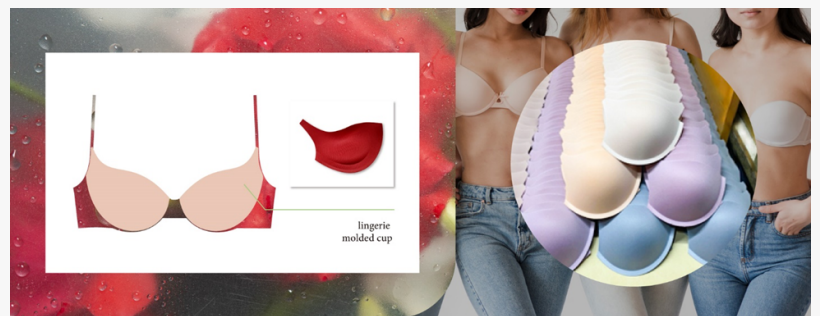
Focus Molded Selection of Products