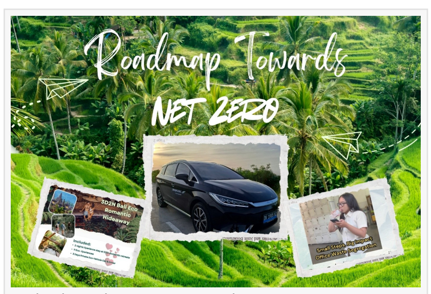
Embark on the Journey Together!

DENPASAR, BALI, INDONESIA, April 29, 2025 /EINPresswire.com/ -- Smailing Tour DMC launch new sustainable travel initiative: "Roadmap Towards Net Zero", a comprehensive plan designed to enhance sustainable practices throughout their travel operations for responsible and sustainable tourism.