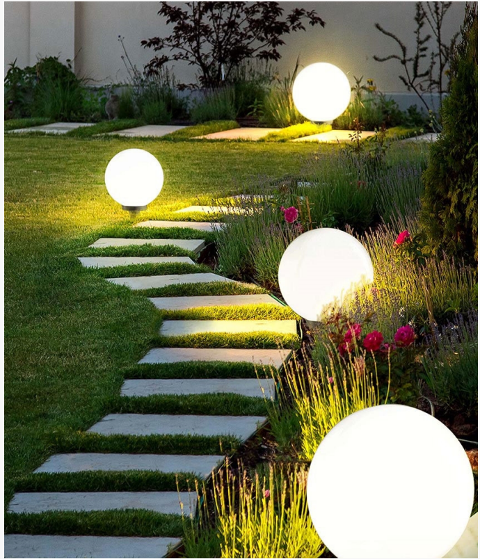
Backyard garden lights

Outdoor pathway lights serve a dual purpose. In addition to providing lighting for navigation,