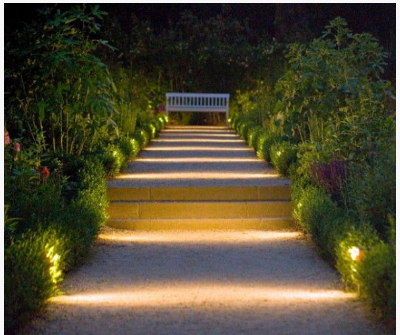
Modern pathway lights