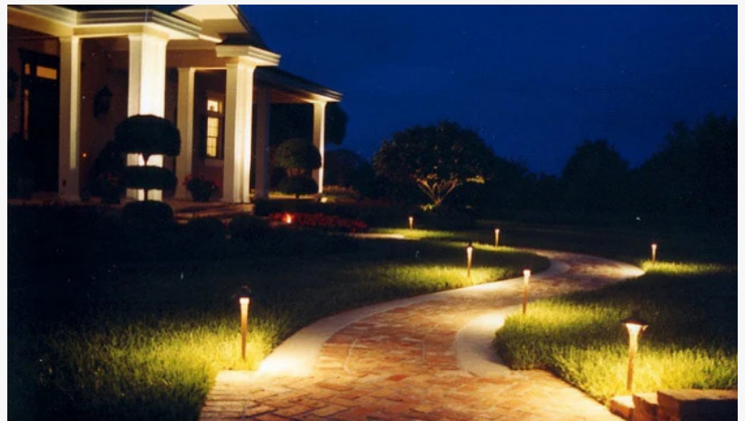
LED pathway lights