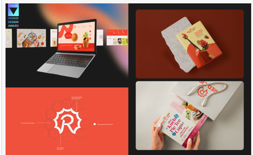
Rebranding Singapore's leading Kueh Pie Tee brand with a vibrant new identity