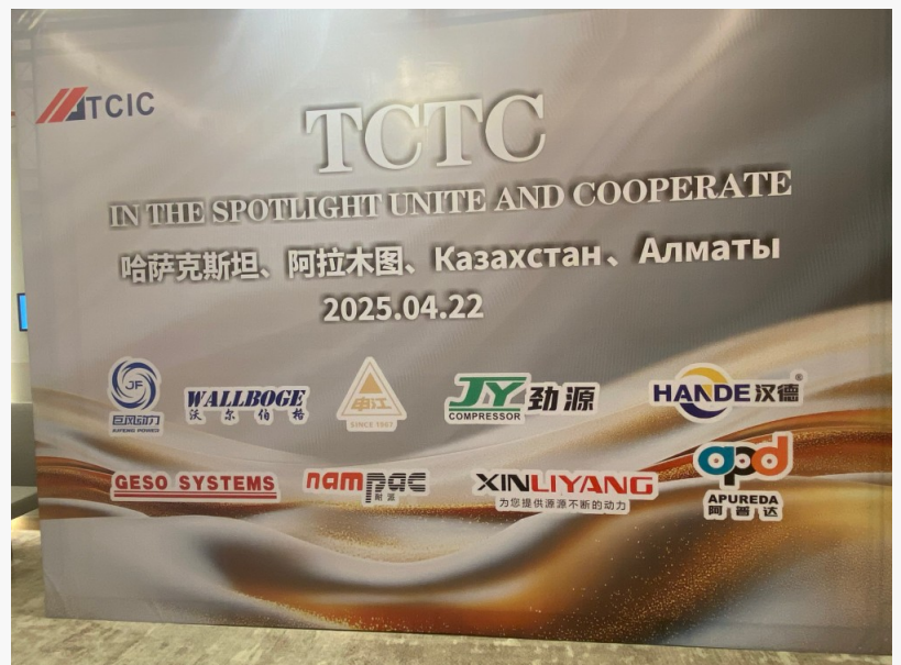
From Vietnam to Central Asia: GESO SYSTEMS Accelerates Its Globalization Strategy Once Again