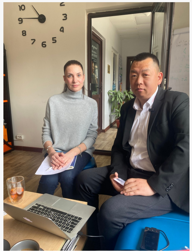
From Vietnam to Central Asia: GESO SYSTEMS Accelerates Its Globalization Strategy Once Again