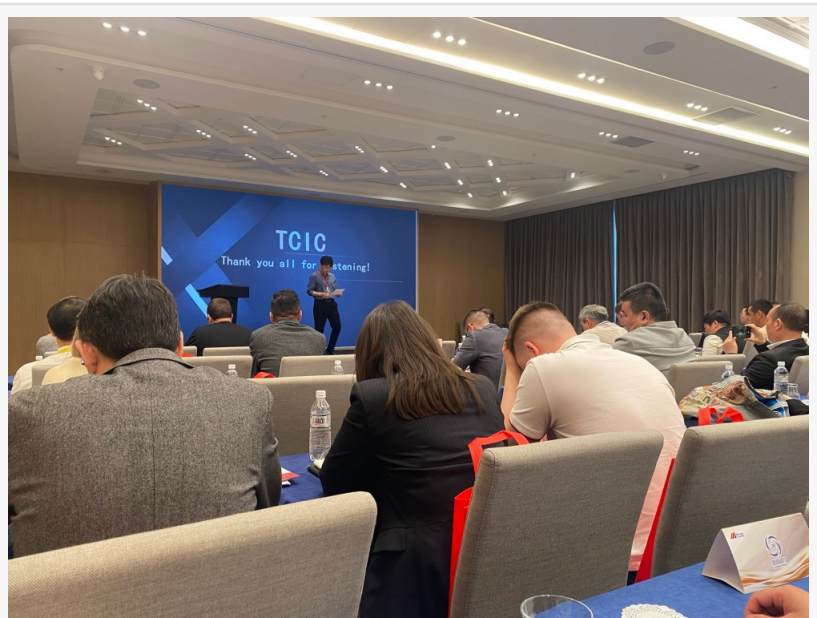
From Vietnam to Central Asia: GESO SYSTEMS Accelerates Its Globalization Strategy Once Again

This press release can be viewed online at: https://www.einpresswire.com/article/807674259