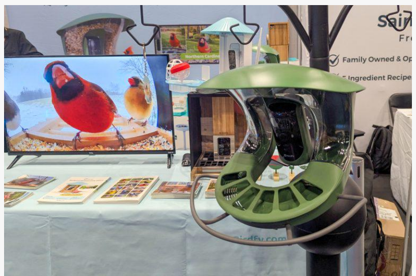
Birdfy at GPE2025

A Noteworthy Debut at Global Pet Expo Held annually in Orlando, Global Pet Expo is a premier event in the pet industry, attracting nearly 20,000 professionals from over 85 countries.