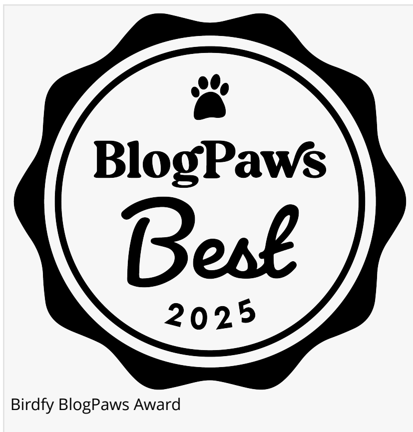
Birdfy BlogPaws Award

Birdfy is honored to receive the BlogPaws Best Award for Best Technology Product, a recognition that celebrates brands driving the pet industry forward through innovation, excellence, and meaningful impact. This award highlights Birdfy's mission to foster well-being through nature-driven experiences by making birdwatching accessible to all — from seniors and children to those with limited mobility — creating moments of quiet joy and connection that resonate across generations.