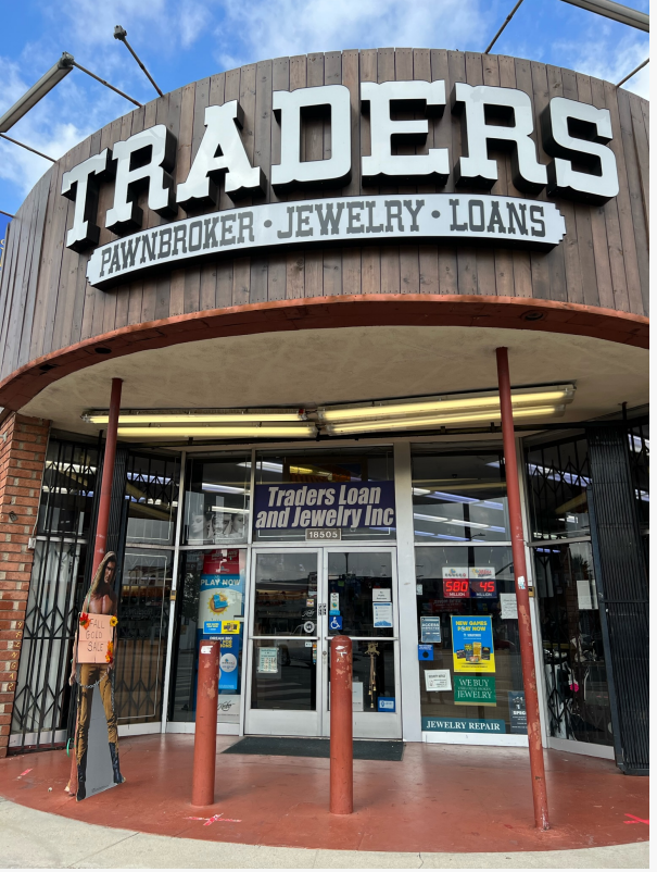
Traders Loan & Jewelry